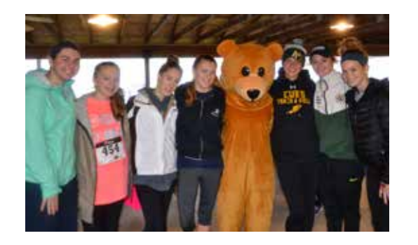
Cub 5K Challenge